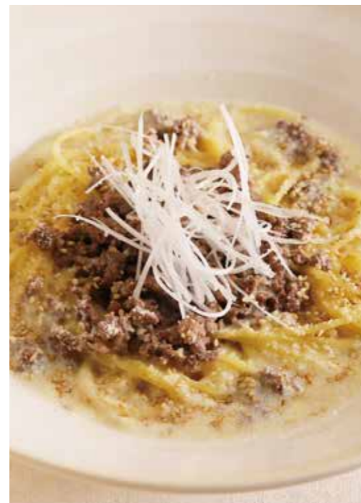
⑥ White Bolognese Made with Ground Awaji Beef, White Sesame, and Soy Milk Fresh Pasta 1720円

Konana's White and Black Bolognese features luxurious use of beef from Awaji Island, raised in its rich natural environment. The well-balanced blend of fat and lean minced beef is crafted into a Bolognese sauce that pairs perfectly with pasta. The White Bolognese, with its white sesame and soy milk base, has a kick of ginger. The Black Bolognese, rich and savory, is made with Hatcho Miso. Are you a fan of the white or the black?