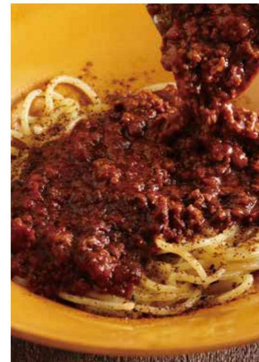
⑦ Black Bolognese Made with Ground Awaji Beef and Hatcho Miso Fresh Pasta 1680円

Konana's "White" Bolognese is a combination of Awaji beef, white sesame seeds, and soy milk. The tangy flavor of ginger enhances the flavorful Bolognese sauce, giving it an addictive taste.