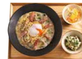
Soy Milk Pudding Set +500円 • A choice of Pasta • Konana's Deli • Soy Milk Pudding