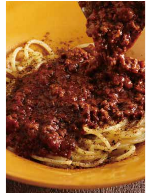
⑦ Black Bolognese Made with Ground Awaji Beef and Hatcho Miso Fresh Pasta 1640円

Konana's "White" Bolognese is a combination of Awaji beef, white sesame seeds, and soy milk. The tangy flavor of ginger enhances the flavorful Bolognese sauce, giving it an addictive taste.