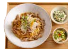
Konana's Deli Set +500円 • A choice of Pasta • Konana's Deli • Homemade Tofu