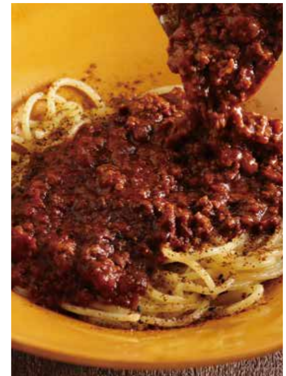
⑦ Black Bolognese Made with Ground Awaji Beef and Hatcho Miso Fresh Pasta 1640円

Konana's "White" Bolognese is a combination of Awaji beef, white sesame seeds, and soy milk. The tangy flavor of ginger enhances the flavorful Bolognese sauce, giving it an addictive taste.